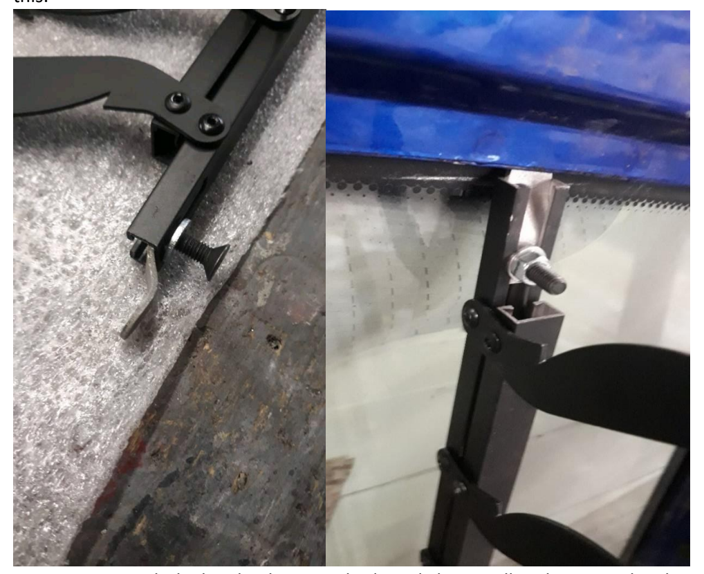
Now you can push the bracket between body and glas, it will stick against the glue of the rear window. Once the blind slats are installed, it becomes even more stable.

For cars with glued rear windows, clips can't be pushed between window and seal of course. must be mounted like this: