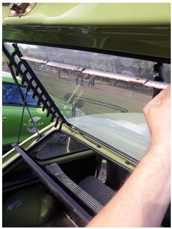
Push the 4 clips between rear window and seal. Some seals are really tight. Heating up with a heat gun or leaving the car outside in the sun can help for sure!